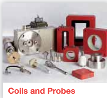
Coils and Probes