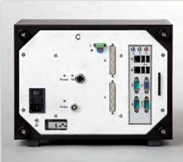
Rear side eddyliner C