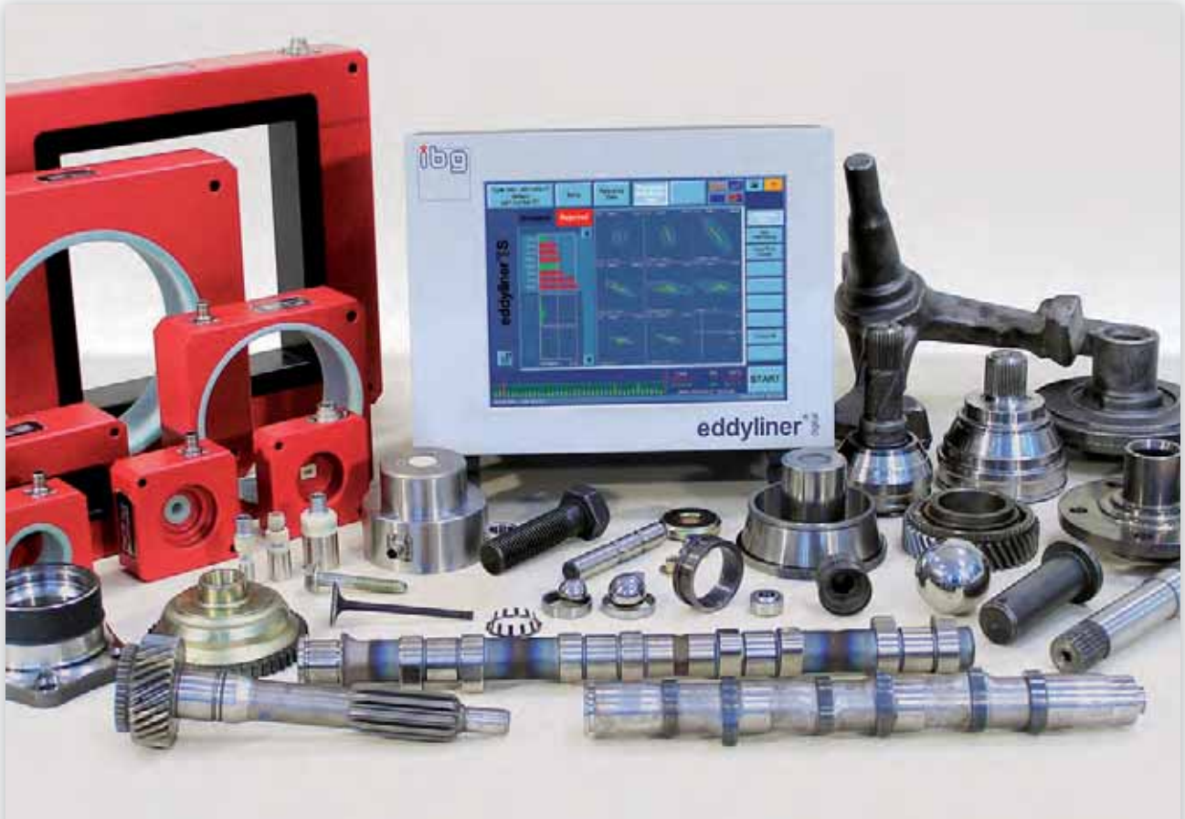
Selection of components - applications solved by ibg technology

The eddyliner digital S distinguishes itself with compact design and concentration on one channel structure applications with one coil at one location combining that with the well-known ibg test reliability and ease of operation. The ergonomic interface facilitates intuitive and simple operation via touch screen. All functions and test results are captured at a glance.