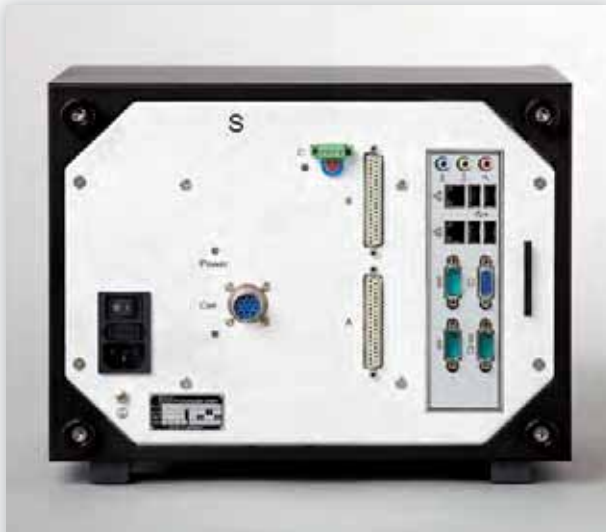
Rear side eddyliner S