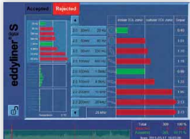
Bargraph display of the test result